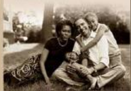
Barack, his wife Michelle, and their daughters Malia (l) and Sasha (r) are active members of Trinity United Church of Christ in Chicago.

Obama forged a profound connection with the people of these communities. At their encouragement, he visited a local church one Sunday. That day Obama felt a beckoning of the spirit and accepted Jesus Christ into his life.