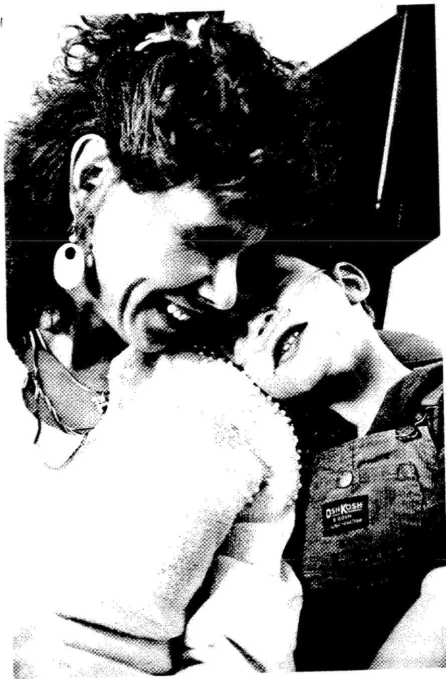
I love my mom . I think she is brave. She stood up for me.