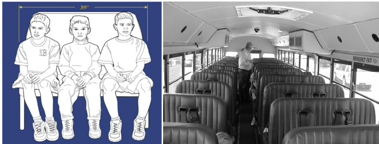
a: A typical 3/3 school bus seat without belts.

There appears to be a way to overcome the loss of capacity due to seat belts: flex seating. “Two manufacturers have introduced school bus seats with lap/shoulder belts on the common 39-inch-width bench seats, which allow the configuration of the belts to be flexible” (NHTSA 2008).